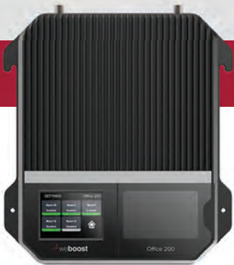
weBoost Installed | Office 200 473047

Introducing weBoost's powerful, turnkey amplifier solution for business.