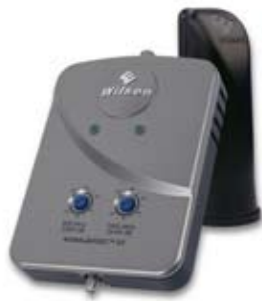
Wilson DT Signal Booster

"I grabbed the phone not expecting much but when I turned it on, I had full bars. I was thinking, 'No way! I went from three bars outside the house all the way to six bars inside the basement.' I made a phone call and it was crystal clear.